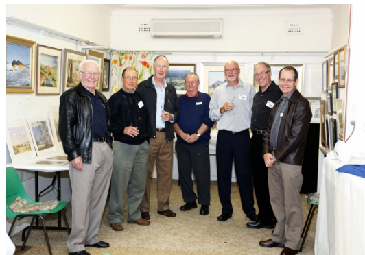
Enjoying the Evening