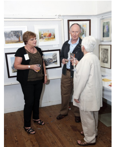
At The Opening

Opening 11.30am All Welcome Collection Sunday 26th June 10.00-11.00am